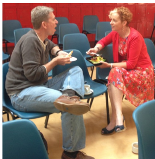
Plotting and planning their parenting and teen programmes!

learning came not only from the tutors and their experiences, but from the other people in the group, as well as some fun and some laughter. Break times brought me back together with my youngest three were we'd picnic in the outside courts attached to the school. The weather was fine, hot sunshine and blue skies and a feeling of contentment seemed to be