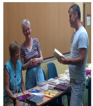
Selling or laughing at the book stall at the Summer School 2013